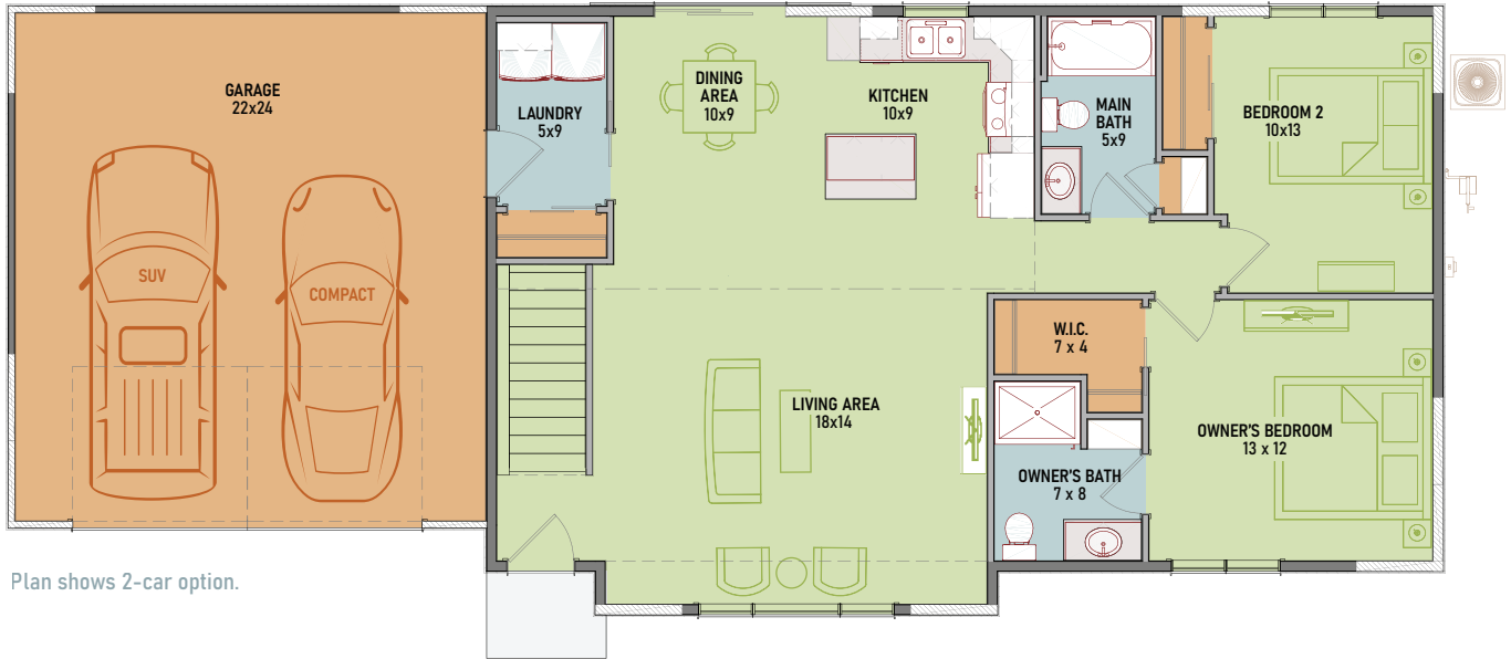
Plan shows 2-car option.

RECEIVE 10% OFF ALL LOWER LEVEL ADDITIONS WITH A LOT & HOME RESERVATION